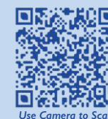
Use Camera to Scan

Give today by visiting marinballet.org or by scanning this QR code.