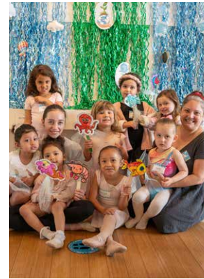
2024 "Beautiful Earth" Summer Camp

Marin Ballet has a robust history of outreach programs, starting in 1989 and continuing to this day. Our strategic plan calls for outreach services to local schools, seniors, and disadvantaged students. Several of these new programs are starting this summer, including our free "Ballet Concepts" class for seniors at Vivaldi , a free performance at the Marin County Fair , and a dance instruction program at Hamilton School . For the second consecutive year, Marin Ballet offered a summer camp for students aged 3 to 9. Over 58% of these students received a scholarship.