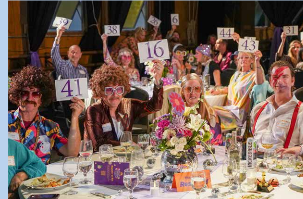
2024 Extravadance Gala

This was largely due to the success of our Extravadance Gala and Fundraiser. 85 ballet parents and supporters raised their bidding cards to vie for an attractive group of auction items.